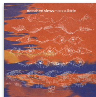
Detached Views (album) Release 30/08/2024