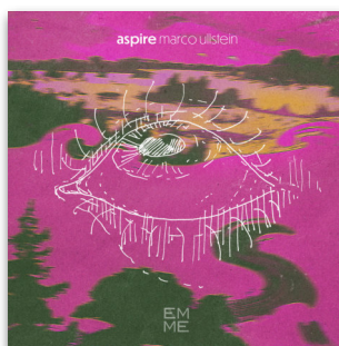
Aspire (single) Release 02/08/2024